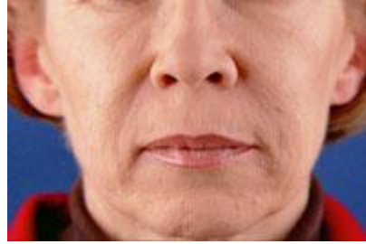
Right picture: Nasolabial lines after