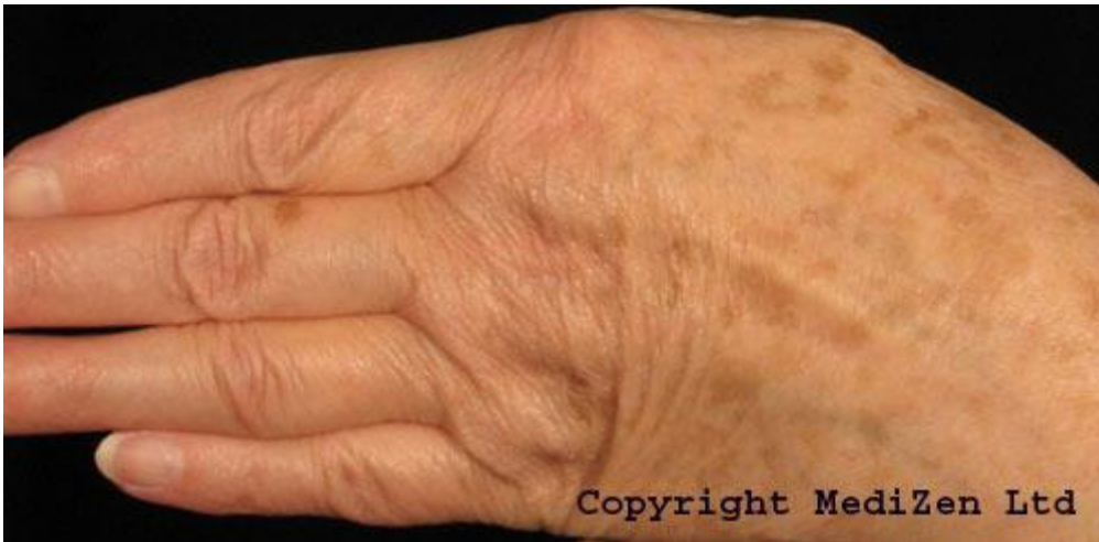
Thin skin and loss of fat revealing veins and bones in the hand.