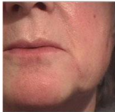
Right picture: Nasolabial folds and oral commissures after