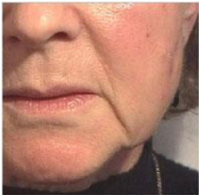
Left picture: Nasolabial folds and oral commissures before