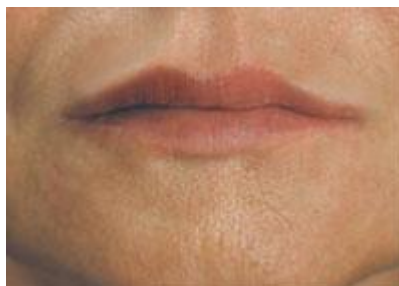
Right picture: Improvement in lip shape and lip lines lines