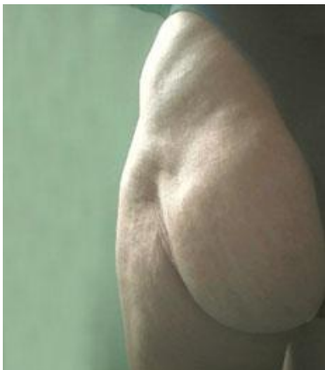
Left picture: Posterior before