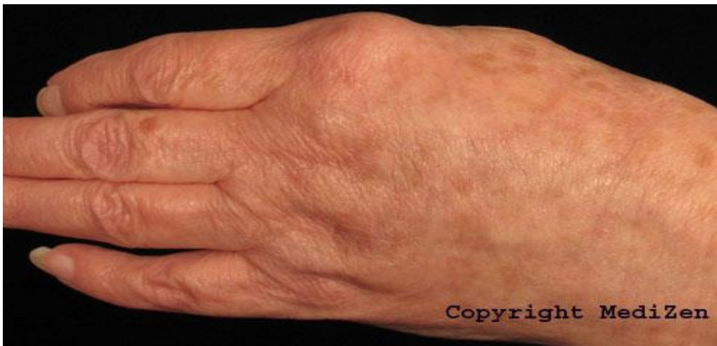
Improvement in appearance following treatment with Radiesse .