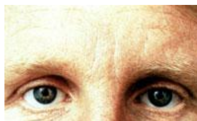
Right picture: Glabellar frown lines after