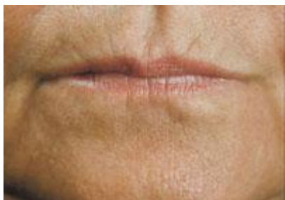
Left picture: Thin lips and lip lines lines