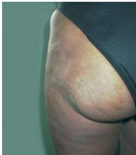
Right picture: Posterior after injection.