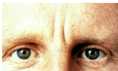
Left picture: Glabellar frown lines before